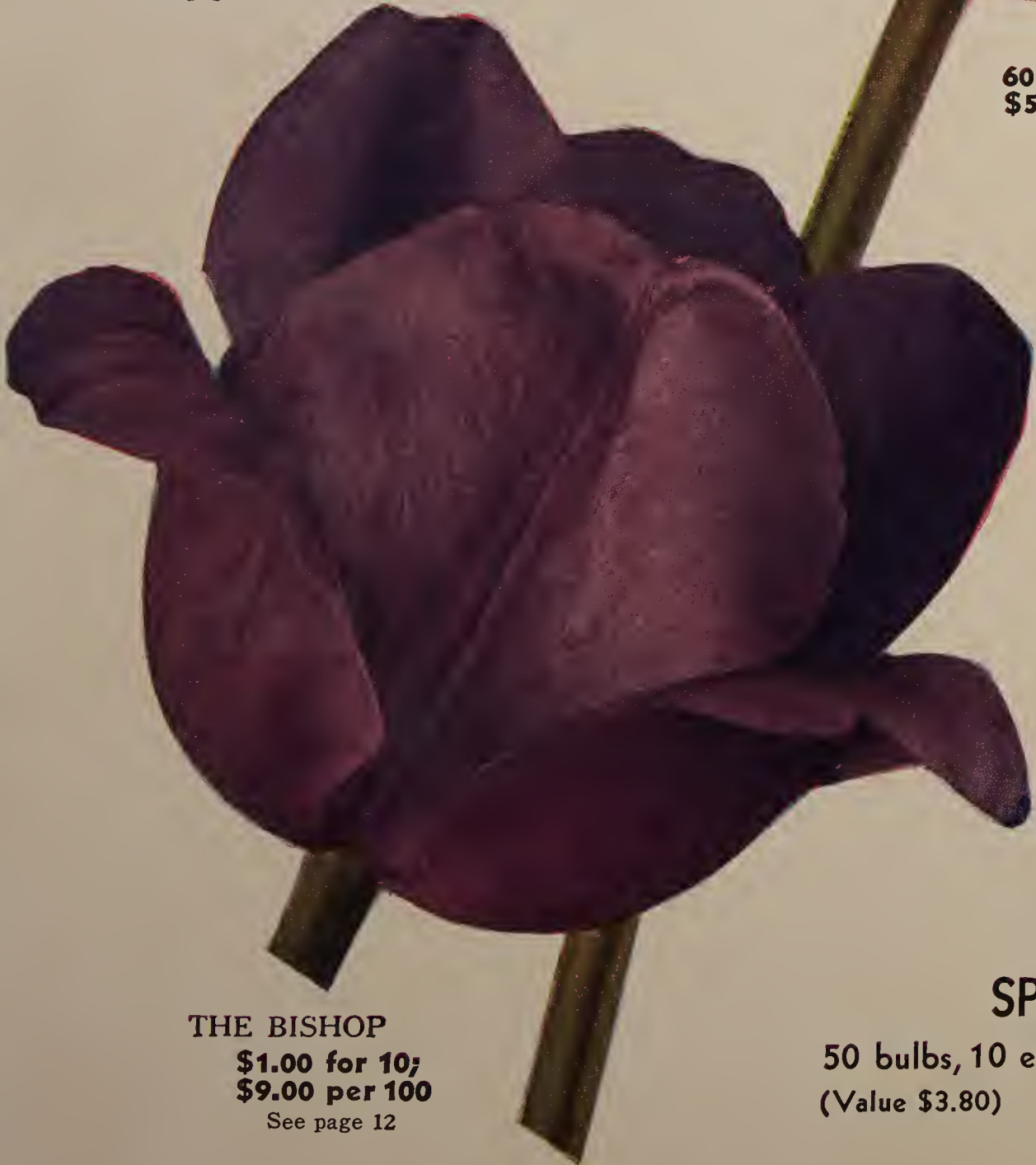
THE BISHOP $1.00 for 10; $9.00 per 100 See page 12